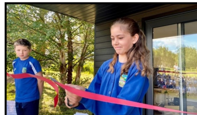
The grand opening!